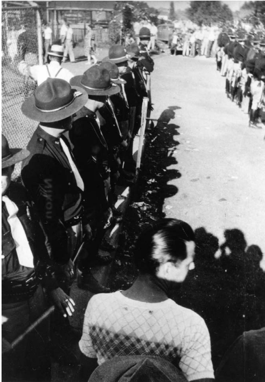
FIGURE 7.1 Indiana State Police stand guard at the Bucyrus-Erie plant during the strike by UE Local 813, 31 August 1948.