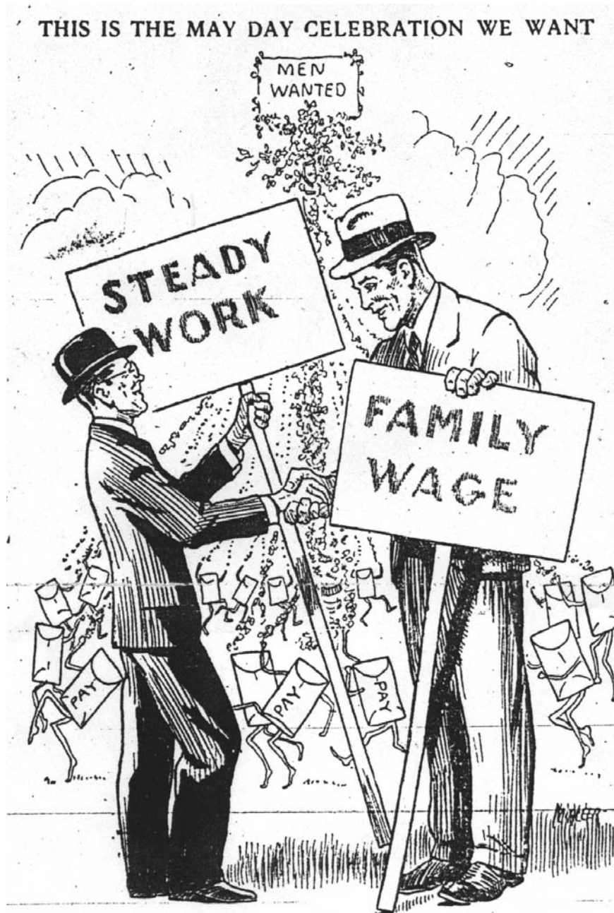
FIGURE 8.1 "This Is the May Day Celebration We Want." The official newspaper of the Archdiocese of San Francisco printed this illustration on the front page of the 4 May 1935 edition. The Catholic labor agenda of cooperation and mutual obligation, with its stress on the (white) man as the breadwinner, is explicitly linked to future prosperity. Credit: The Monitor, 4 May 1935.