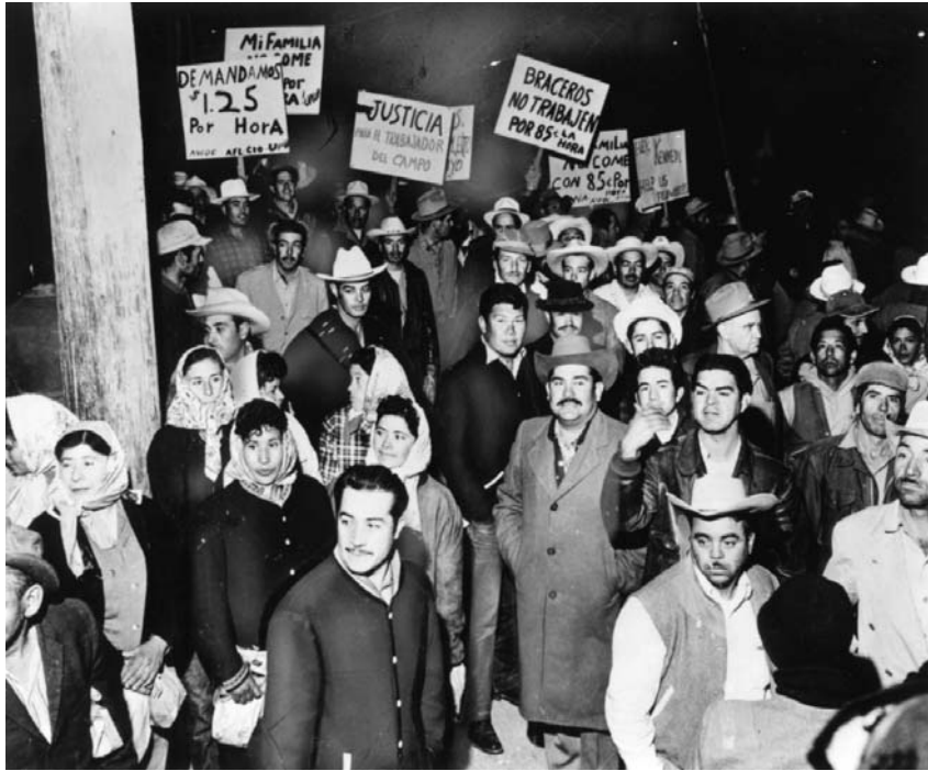
FIGURE 3.1 In 1961 domestic field workers in the Imperial Valley struck sixteen ranches. The strike was supported by the Agricultural Workers Organizing Committee, AFL-CIO, and by the United Packinghouse Workers of America.