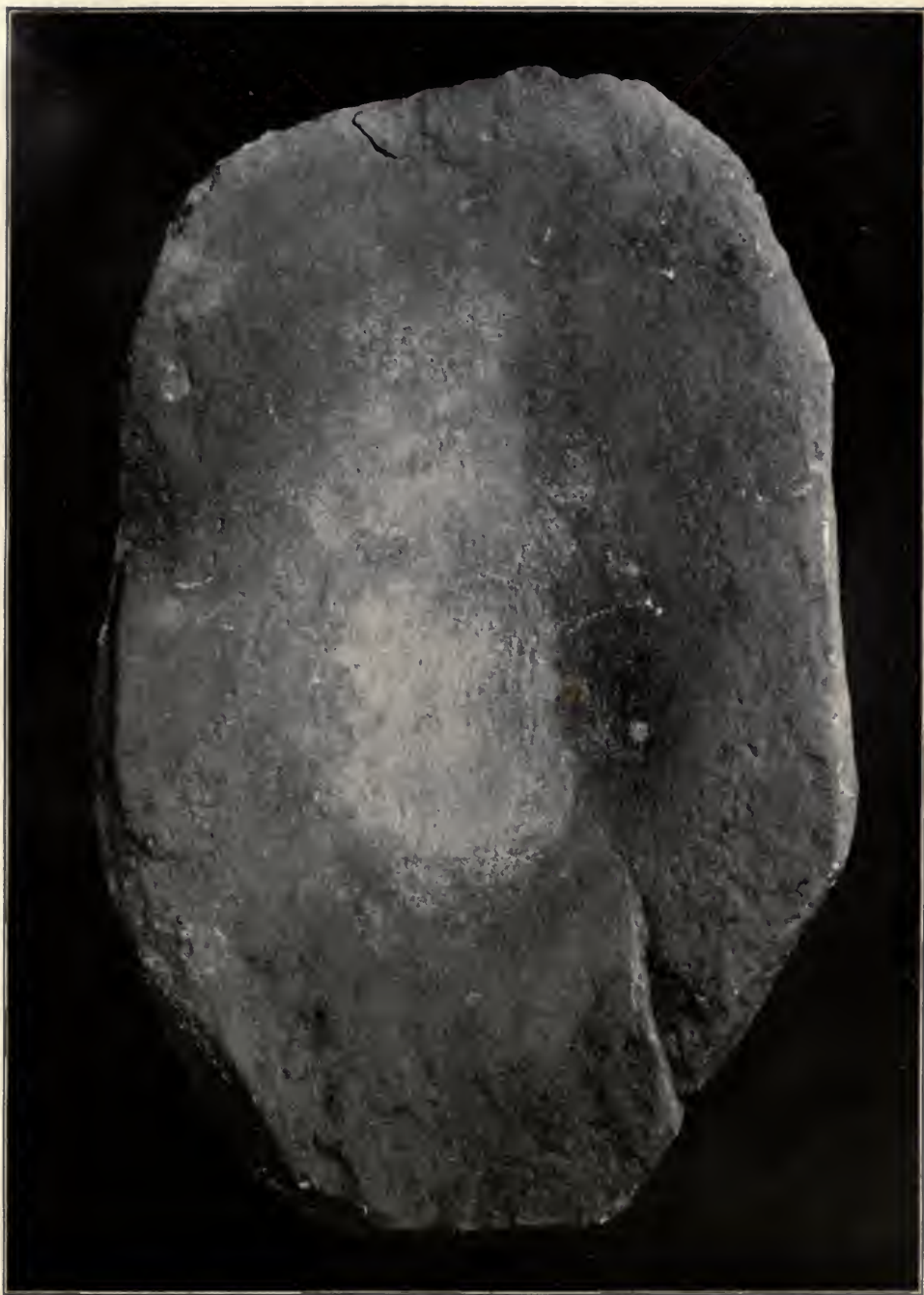
LOWER MILLING STONE FOUND WITHIN A TIPI CIRCLE.