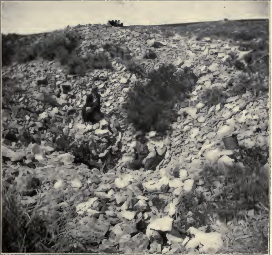
DETAILED VIEW OF PITS, SHOWING EXTENT OF WORKINGS.