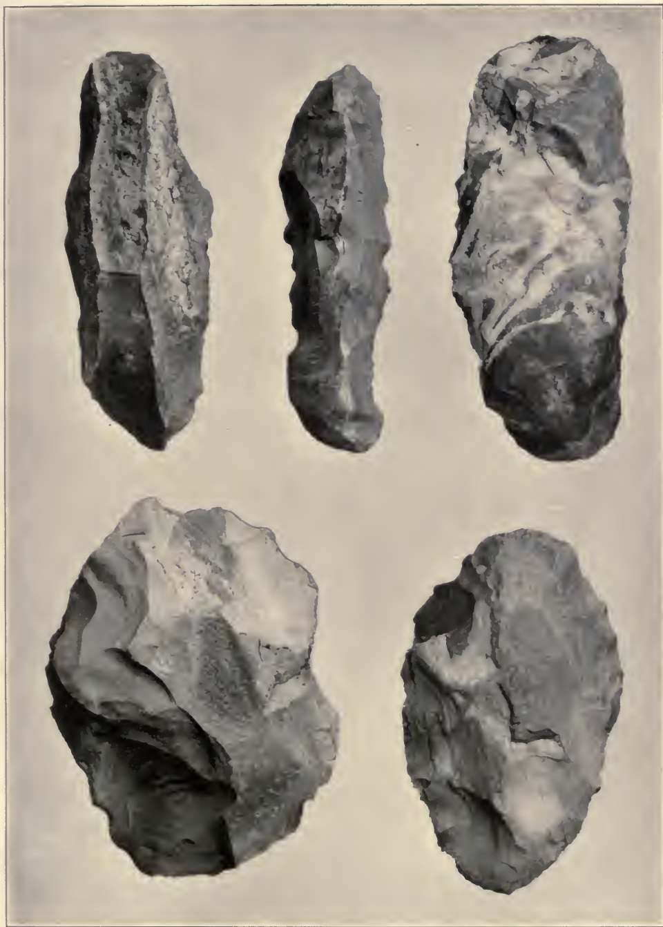
TYPICAL REJECTS FROM NEIGHBORHOOD OF PITS.