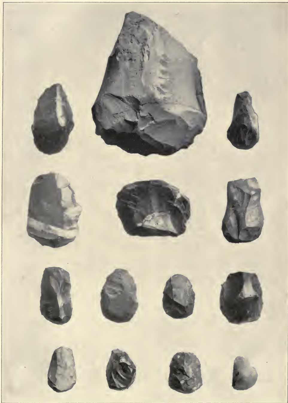
CHARACTERISTIC SCRAPERS FROM NEIGHBORHOOD OF TIPI CIRCLES.