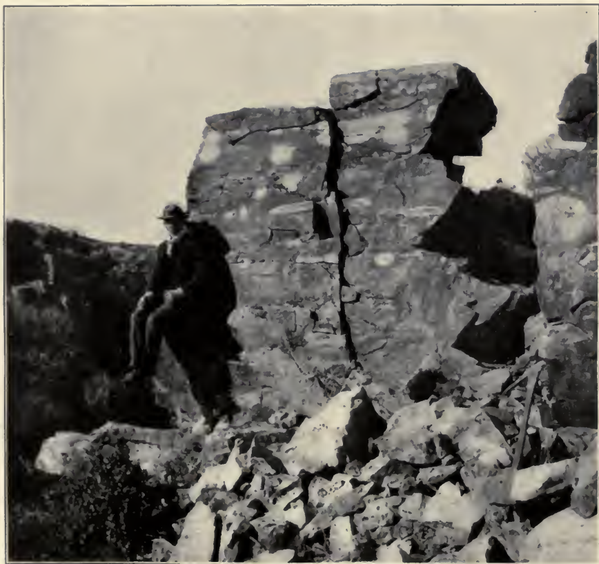
DETAILED VIEW OF QUARTZITE STRATUM, SHOWING COLORED MASSES OR GEODIC PHASES.