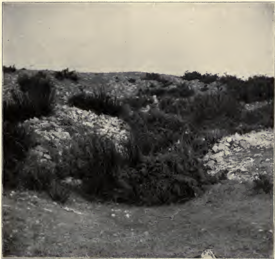
GENERAL CHARACTER AND CONTOUR OF PITS.