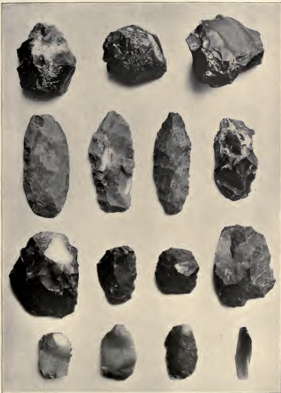
TYPICAL REJECTS AND FLAKES FROM NEIGHBORHOOD OF TIPI CIRCLES.