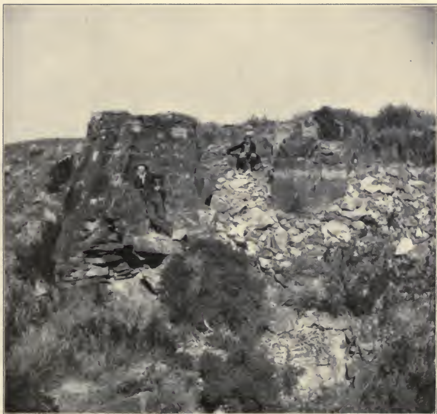
WALL OF RAVINE WITH EXPOSED STRATUM OF QUARTZITE.