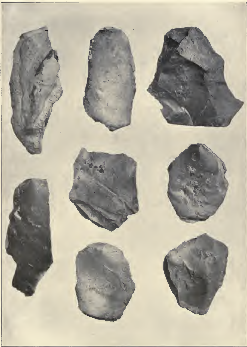
TYPICAL FLAKES FROM PITS.