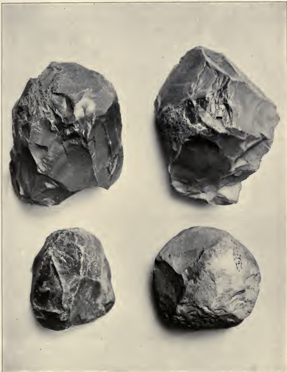
COMPACT QUARTZITE MASSES USED AS HAMMER-STONES.