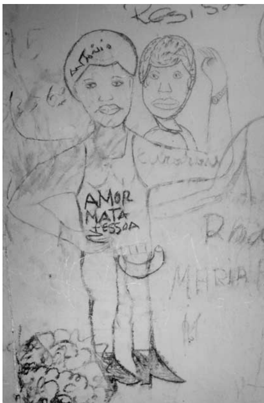
AMOR MATA PESSOA: LOVE KILLS (LITERALLY, LOVE KILL PERSON) – GRAFFITI ON A BOMBED BUILDING AT THE WAR'S FRONT IN MOZAMBIQUE, 1991.