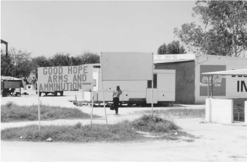
STORE IN NORTHERN NAMIBIA, NEAR THE ANGOLAN BORDER, 2001. JUST BEFORE THE END OF THE ANGOLAN WAR.