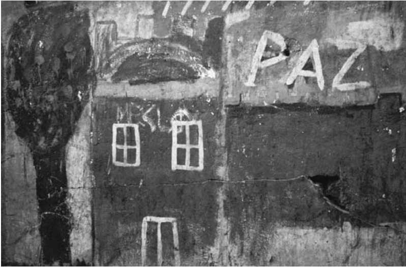
PEACE IN THE MIDST OF WAR: PUBLIC WALL FRONTING PEACE'S HOME – A BARREN DIRT HILL IN THE CITY CENTER.