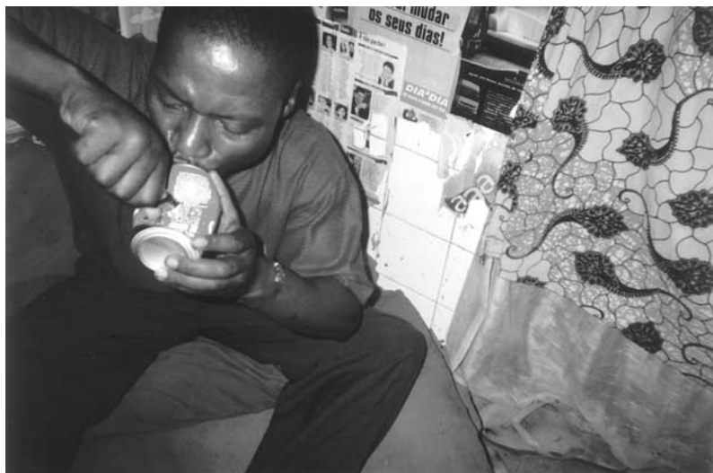
THE SUFFERING OF THE STREETS: HOMELESS WAR-DISPLACED MAN SMOKING CRACK.