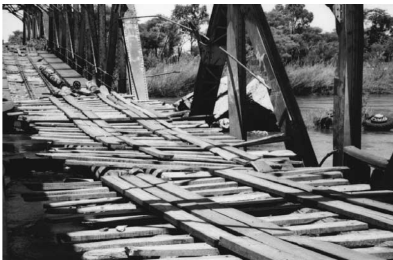
"NO-MAN'S-LAND": BRIDGE MARKING THE FRONT LINES. ANGOLA, 2001.