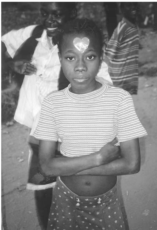
"REMEMBER TO HAVE SOME HEART," SHE SAID, REFERRING TO THE IMPACT OF THE WAR. ANGOLAN GIRL IN HOMELESS CAMP.