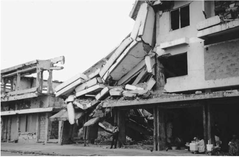
FRONT-LINE MARKET: BEER AND BISCUITS AMIDST THE RUINS.