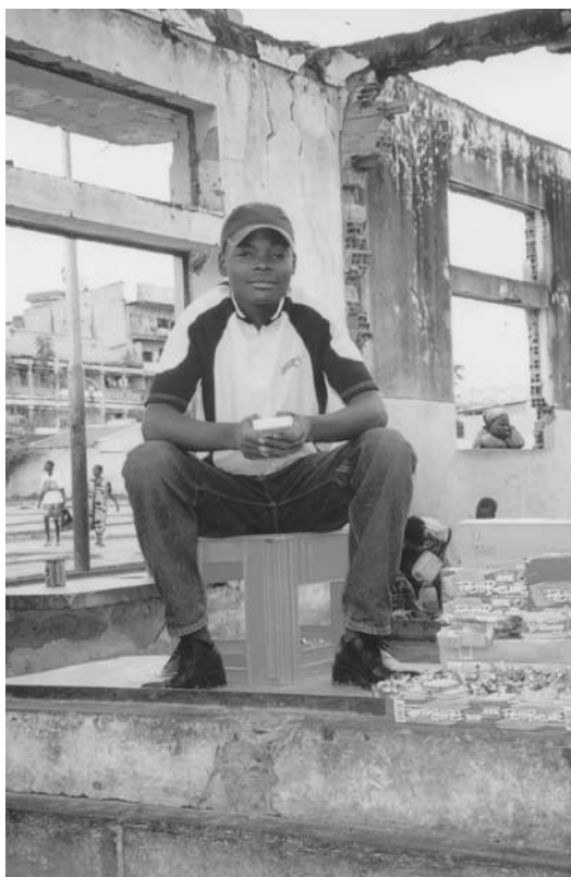
MARKETS RISING FROM THE ASHES. KUITO, ANGOLA, 2001.