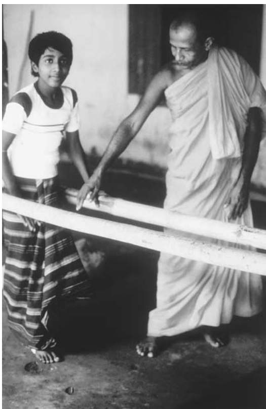
WOUNDED BOY RECEIVING THERAPY IN A MAKESHIFT CLINIC IN A SMALL BUDDHIST TEMPLE IN SRI LANKA. THE TEMPLE AND MONK WERE ATTACKED AFTER THIS PHOTO WAS TAKEN IN 1985.