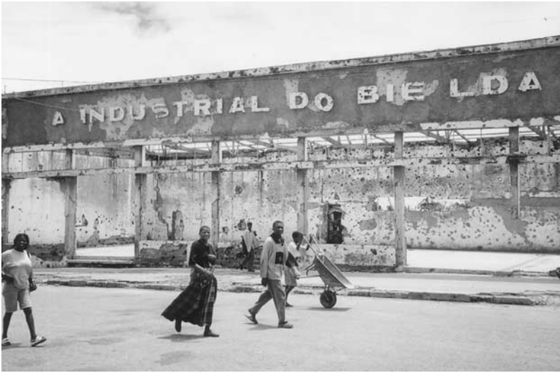
"VISIBLE" INDUSTRIES IN RUINS; BEHIND THIS, DEVELOPMENT TAKES PLACE IN THE SHADOWS. BIE PROVINCE, ANGOLA, 2000.