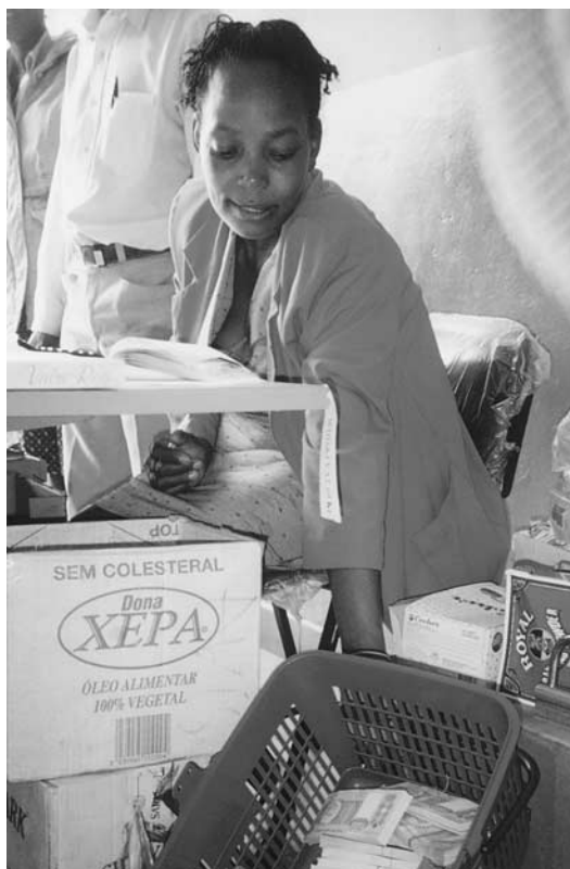
"THE FORTUNES OF WAR:" WOMAN RUNNING A STORE ON THE FRONT LINES, HOLDING UP HER "CASH REGISTER" FULL OF MONEY. BIE PROVINCE, ANGOLA, 2001.