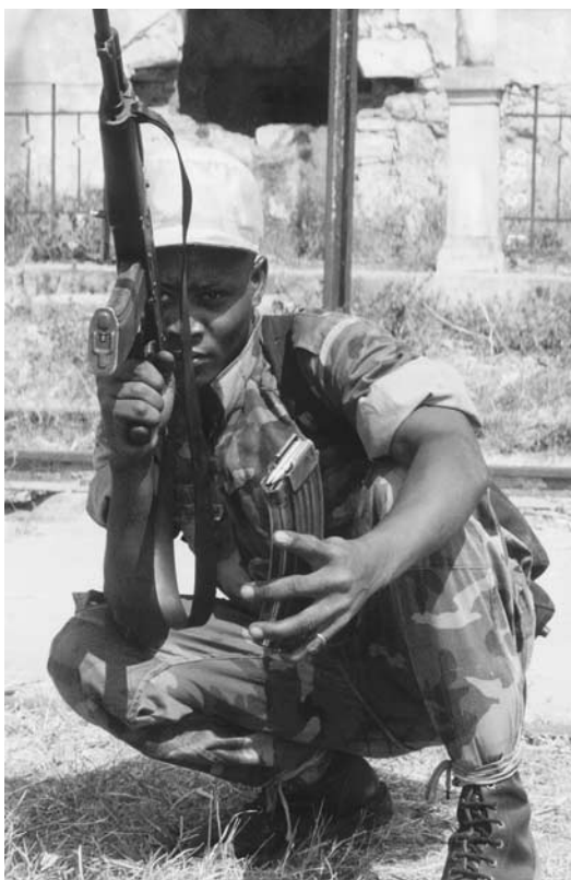
"TAKE MY PICTURE," HE COMMANDED, POINTING HIS GUN AT ME. MALANGE, ANGOLA, 1999.