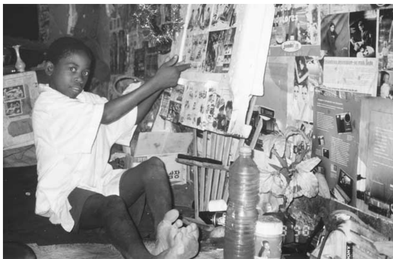
WAR ORPHANS' AND STREET CHILDREN'S HOME INSIDE A STORM DRAIN UNDERNEATH CITY STREETS IN LUANDA, ANGOLA.