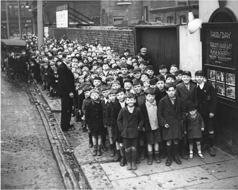
10. A Saturday matinee queue in Plaistow, east London, 1937.

television and video gave children greater access to ‘unsuitable’ material than ever before. Subsequently, controversies about all kinds of new media have followed in quick succession, with recent targets including playground text-messaging and Internet chatrooms. 6