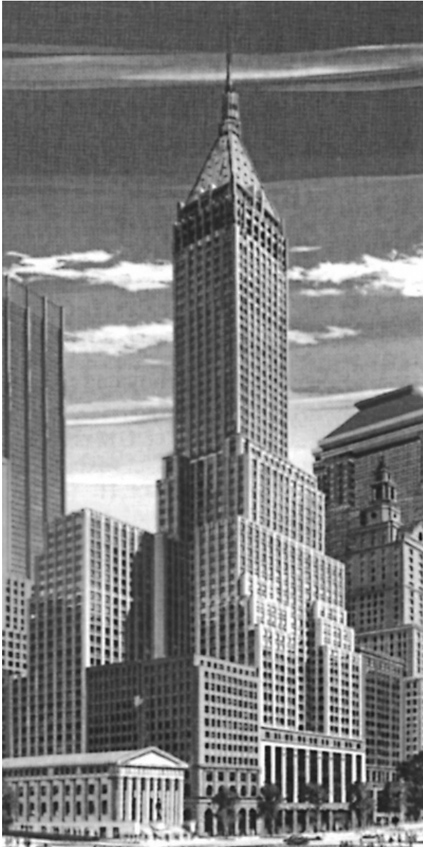
40 Wall Street