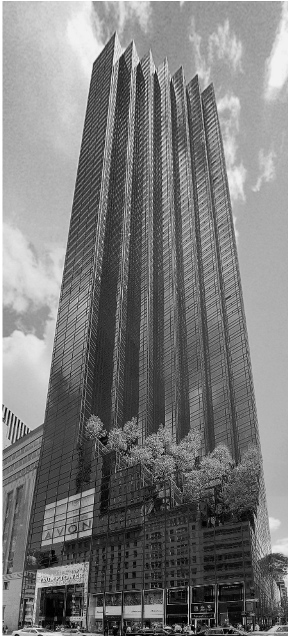
Trump Tower on 5th Avenue