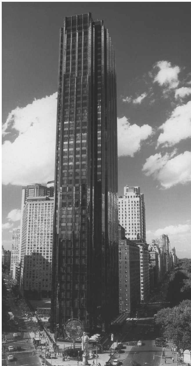
Trump International Hotel and Tower