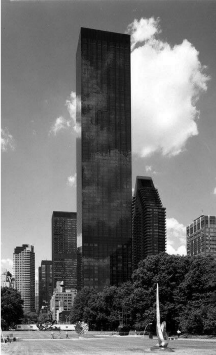
Trump World Tower at United Nations Plaza