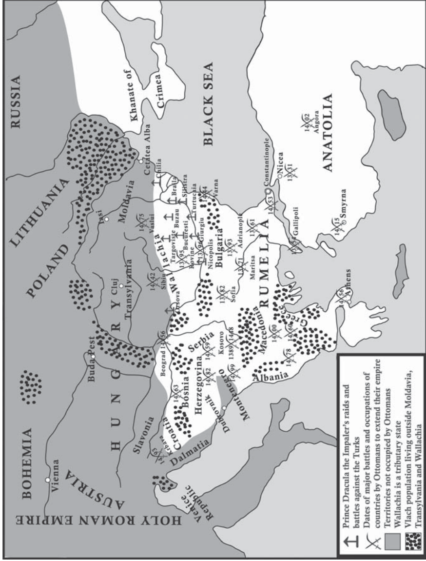
Map 4. The Balkan Peninsula: 1453–1500.