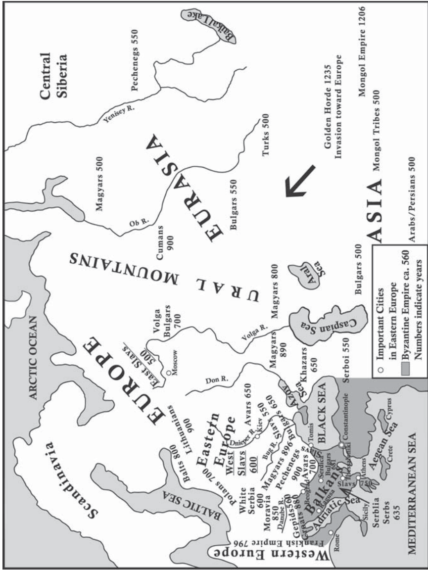
Map 1. Migration of the Eurasian Tribes in Eastern Europe and Years of Their First Settlements, C.E. 500–900.